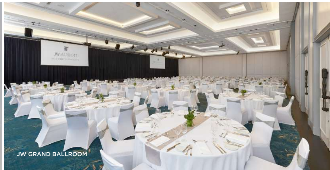
JW GRAND BALLROOM