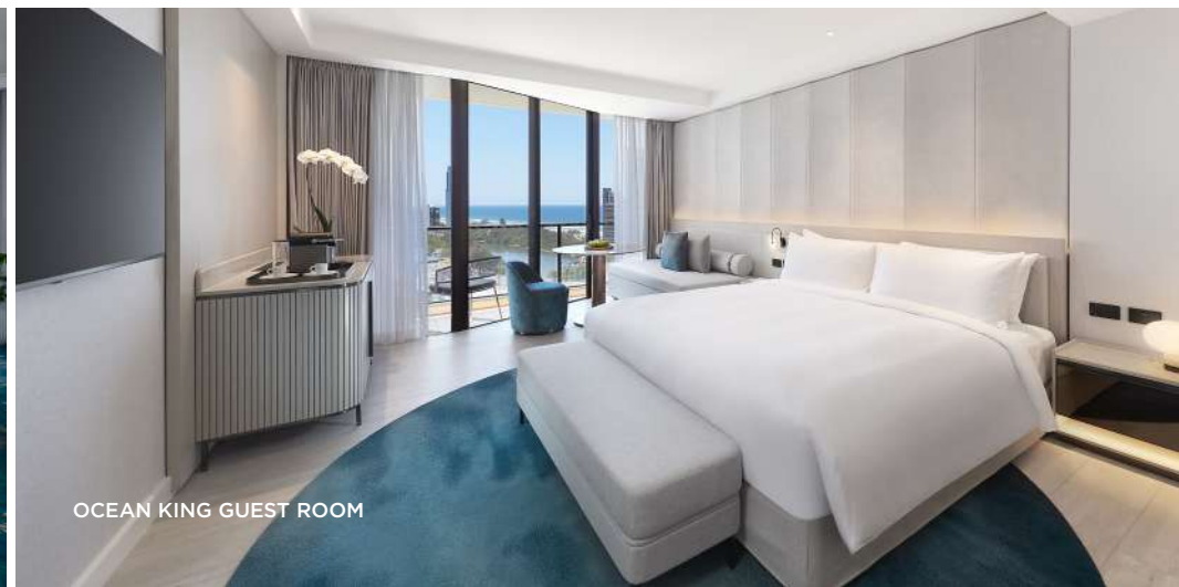
OCEAN KING GUEST ROOM