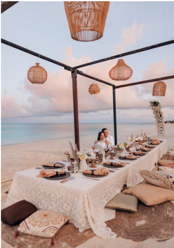
*Bohemian Picnic Setup