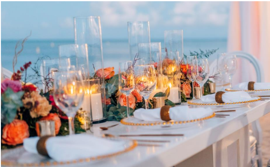
*La Vie en Rose Setup