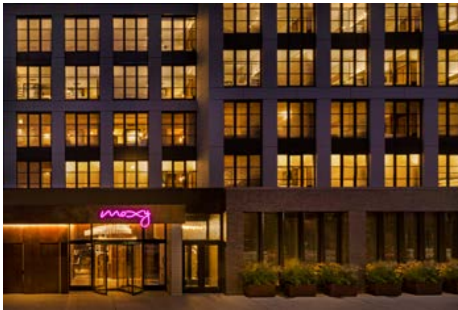
The Moxy East Village became New York City's newest hotel when it opened last month. MOXY EAST VILLAGE

Paradoxically yet appropriately enough, one of the city's newest hotels is just such a place. The recently opened Moxy East Village pays playful homage to New York City's storied past, and is designed to be a palimpsest whose layers unearth the spirit of Manhattan's iconoclastic East Village.