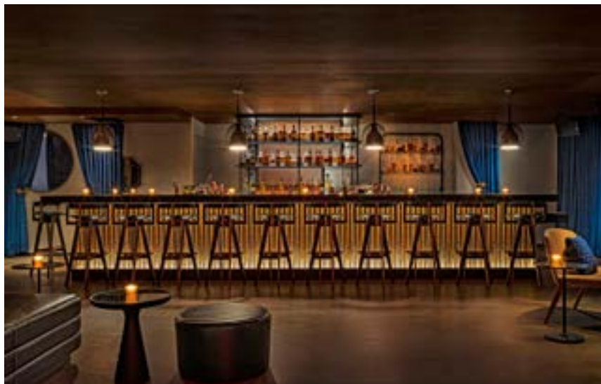
The bar's base is decorated with organ pipes.