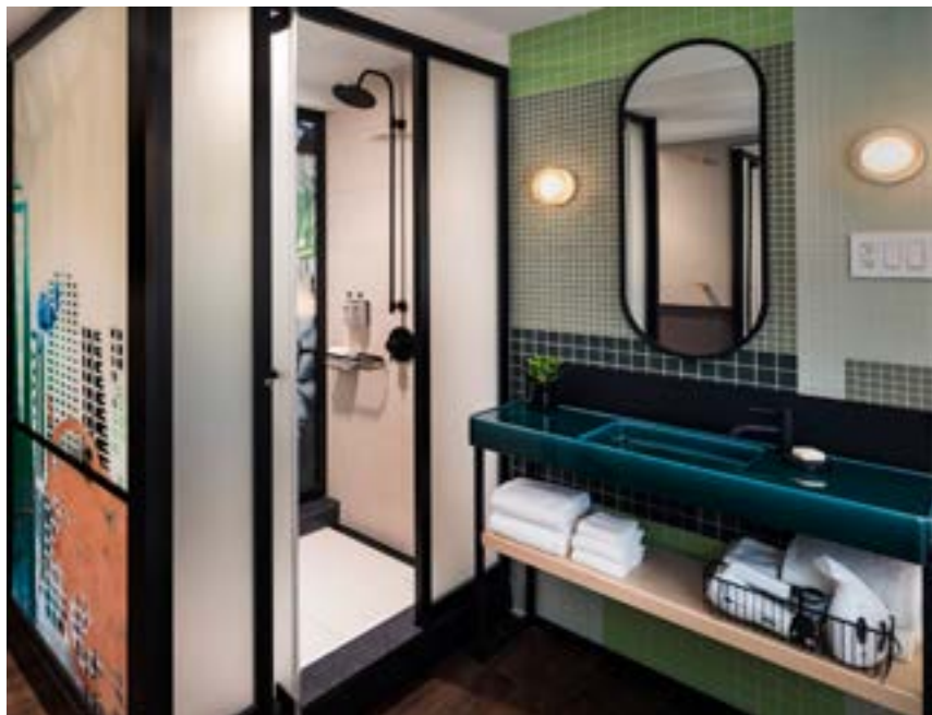
Showers are shielded by graffitied glass walls. MOXY EAST VILLAGE

All have large windows for prime views of Manhattan's skyline and the surrounding streets – an effort to bring more of the neighborhood inside. Otherwise, the look is similar to that of the brand's other hotels in the city. Think metal canopy beds dressed in white linens (and headboards made from woven seatbelt material) with built-in storage drawers. Modular side tables and wall-mounted pegs for hanging clothes replace standard work desks and wardrobes, respectively. The Wi-Fi is fast and free and guests can stream their own content over 43-inch flatscreen HDTVs.