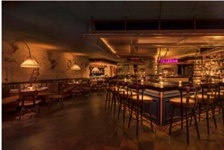
The bar pays homage to the area's famous rock clubs. MOXY EAST VILLAGE

The design concept was inspired by the East Village's rock-'n-roll heyday of the 1960s and 1970s, especially the so-called "Church of Rock and Roll," Fillmore East. It was there that visionary musical promoter Bill Graham mounted shows by rock icons like Jimi Hendrix and The Grateful Dead. Neon signs from other famous local venues, such as Palladium and The Saint, blaze over the bar. In the main dining room hangs an enormous overhead wire-mesh sculpture titled Fillmore that recreates a sort of ethereal, ghostly, yet gritty version of Fillmore East's dome ceiling.