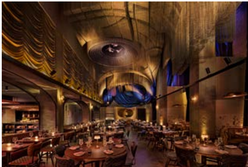
Be sure to look up at Cathédrale's sculptural ceiling. MOXY EAST VILLAGE

The design concept was inspired by the East Village's rock-'n-roll heyday of the 1960s and 1970s, especially the so-called "Church of Rock and Roll," Fillmore East. It was there that visionary musical promoter Bill Graham mounted shows by rock icons like Jimi Hendrix and The Grateful Dead. Neon signs from other famous local venues, such as Palladium and The Saint, blaze over the bar. In the main dining room hangs an enormous overhead wire-mesh sculpture titled Fillmore that recreates a sort of ethereal, ghostly, yet gritty version of Fillmore East's dome ceiling.