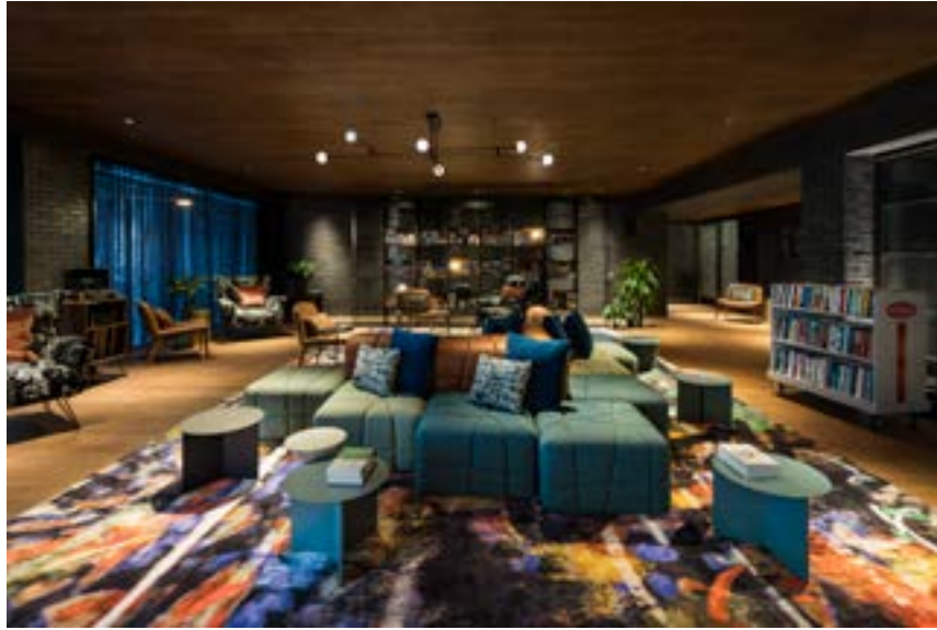
The vibe at Alphabet Bar changes throughout the day. MOXY EAST VILLAGE

Design firm Rockwell Group Design made sure to put those rebellious roots on full display in eye-catching elements throughout the property. The overriding concept was of an urban archaeology project, with each of the hotel's 13 floors representing different eras in the East Village's timeline – past, present and future.