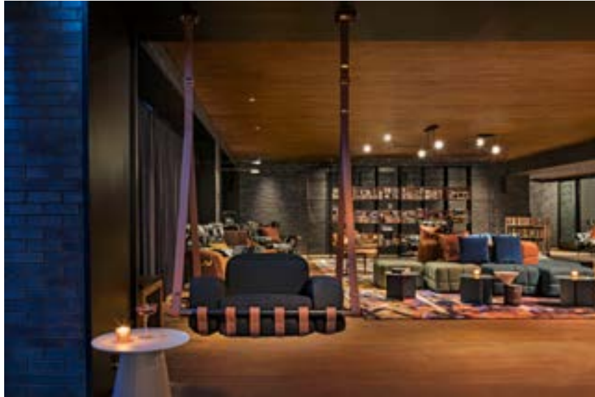
Grab a seat on the swing if you can. MOXY EAST VILLAGE

There are even a few swinging chairs and a Skee-Ball game thrown in for fun. The shelves against the back wall hold multitudes of mix tapes, while a library cart holds borrowable books from nearby landmark bookstore The Strand. Guests can also request record players and vinyl LPs compiled by Academy Records to be delivered to their rooms for private listening.