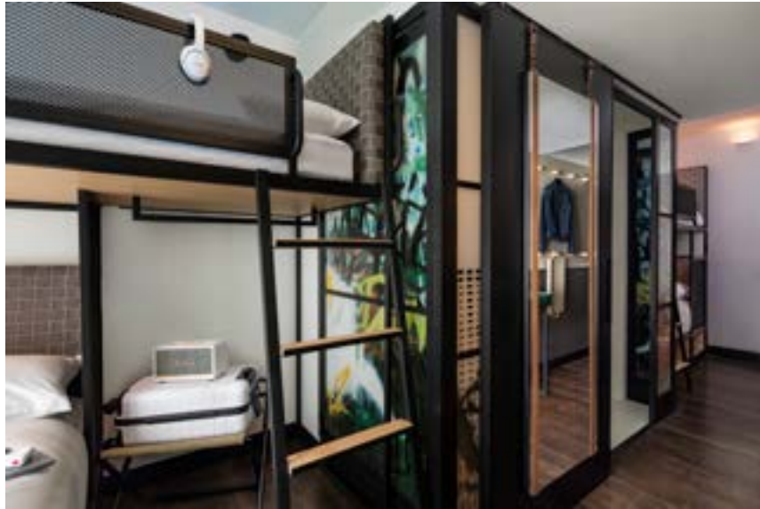
Families might prefer the quad bunk rooms. MOXY EAST VILLAGE

All have large windows for prime views of Manhattan's skyline and the surrounding streets – an effort to bring more of the neighborhood inside. Otherwise, the look is similar to that of the brand's other hotels in the city. Think metal canopy beds dressed in white linens (and headboards made from woven seatbelt material) with built-in storage drawers. Modular side tables and wall-mounted pegs for hanging clothes replace standard work desks and wardrobes, respectively. The Wi-Fi is fast and free and guests can stream their own content over 43-inch flatscreen HDTVs.