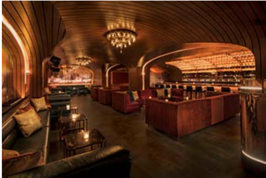
Little Sister is meant to feel like a bootlegger's bar. MOXY EAST VILLAGE

After a night out dining and drinking at the hotel's various outlets, it might be time to retire to your room, riding up in a mirrored elevator with emojis etched on the glass. The effect is at once trippy yet fun.