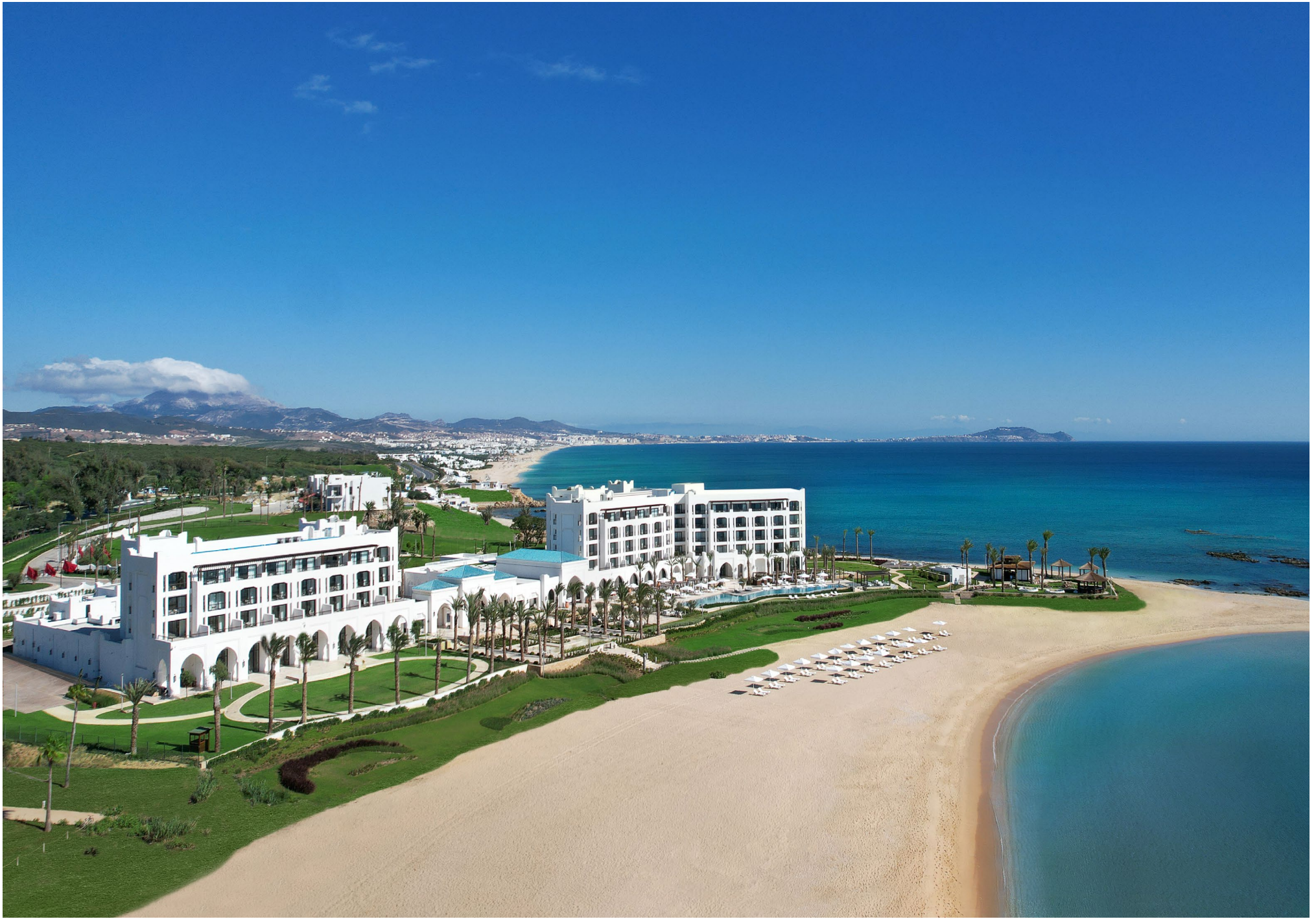
The St. Regis La Bahia Blanca Resort - Aerial