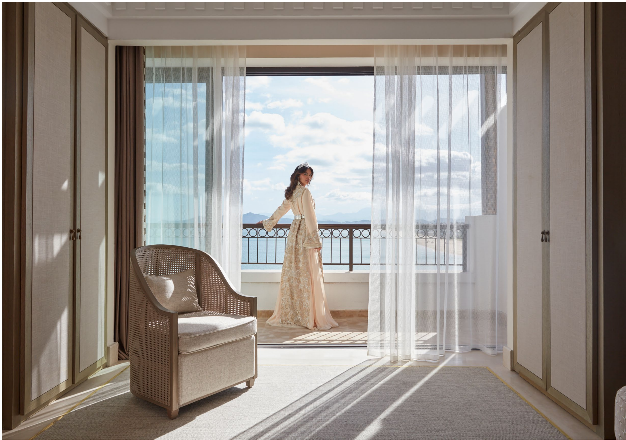
Royal Suite - Dressing