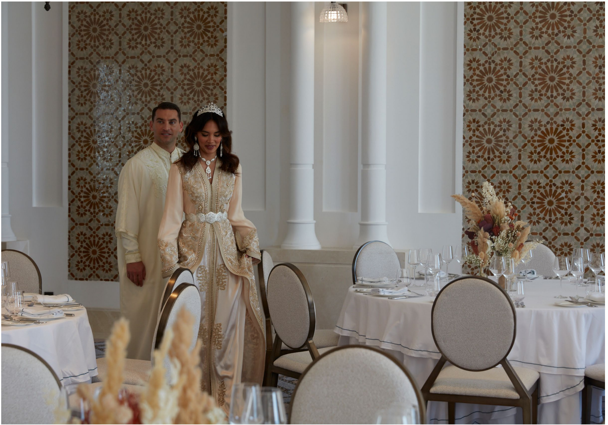
The Astor Ballroom