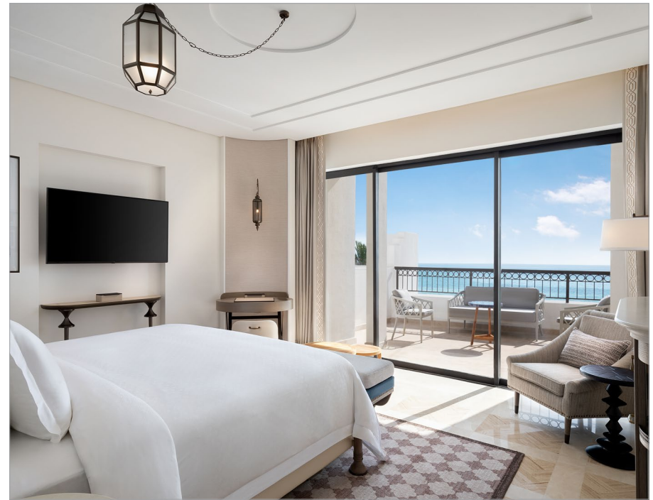
Deluxe Guest Room

Occupying a privileged fourth floor setting, the Royal Suite has panoramic seaviews. Infusing signature design with local craftsmanship, it is an expression of artful living, where natural materials add regional significance. The neutral color palette creates a sophisticated canvas, layered with destination-inspired details, including vibrant flecks of Chefchaouen blue. A refined private residence, the suite flows across living and dining areas, office and master bedroom, furnished with walk-in dressing room. Transcending the ordinary, the St. Regis Butler oversees every personalized detail.