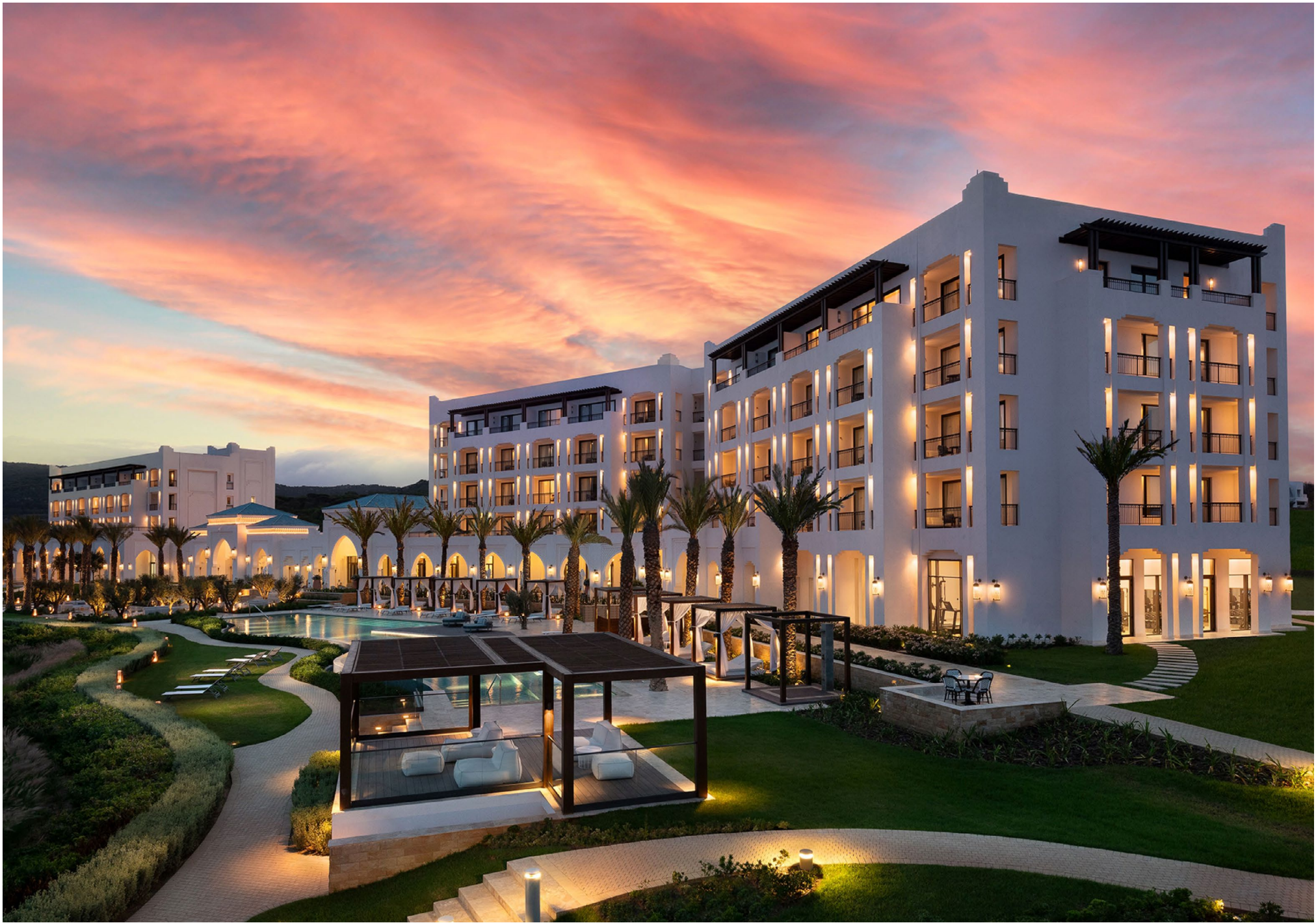
The St. Regis La Bahia Blanca Resort