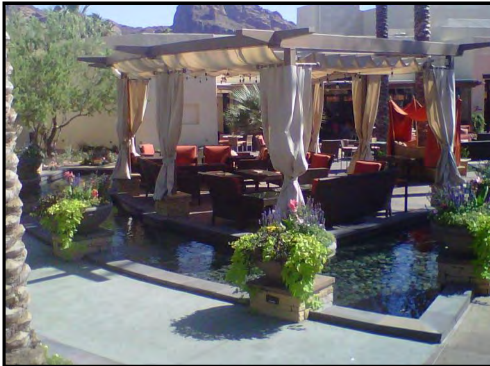
The RBAR Pergola

Picturesque views of Mummy Mountain, our garden, courtyard and is surrounded by water features.